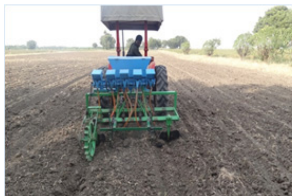
Tractor operated Broad Bed Furrow Maker