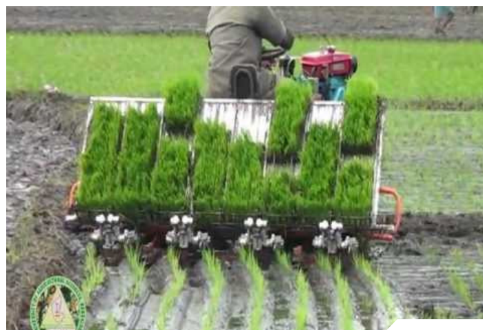
Mechanical paddy transplanting.