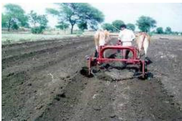
Bullock operated Tropicultor